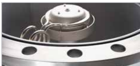
Diffusion pump cold cap baffle