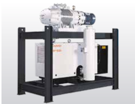
RUVAC WAU 2001 / SCREWLINE SP 630 frame mounted version

Paraffin binders evaporate without thermal decomposition. If their vapors enter the SCREWLINE SP, the internal temperatures of the pump are just in the right window to avoid build-up of layers by cracking and to keep the condensate in liquid phase. Paraffin binder vapors can be handled without any enhanced maintenance demand.