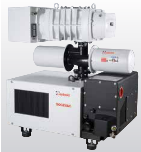
RUVAC WH 2500-FC / TwinFilter 500 / SOGEVAC SV 470 B adapter version

“Vacuum systems based on SOGEVAC rotary vane pumps deliver the best cost vs. performance ratio for the broad base of less demanding heat treatment applications”