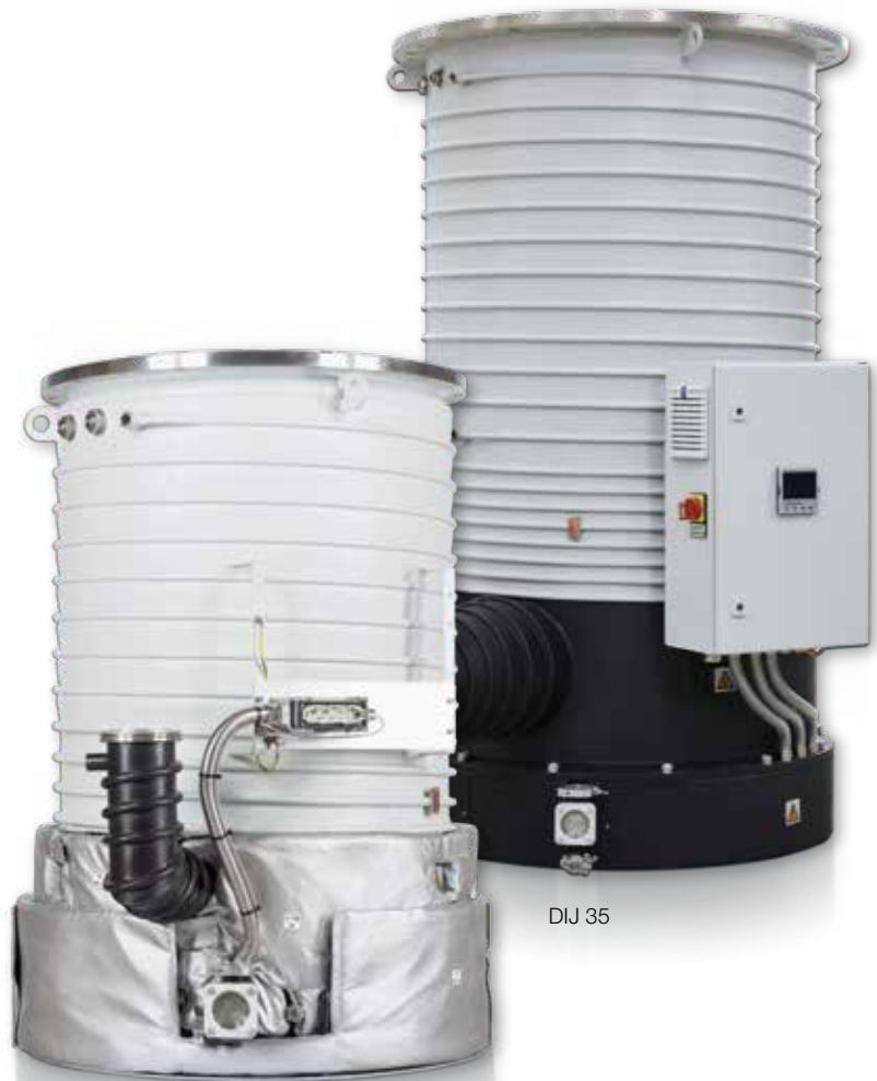
DIP 20 000 with thermal insulation