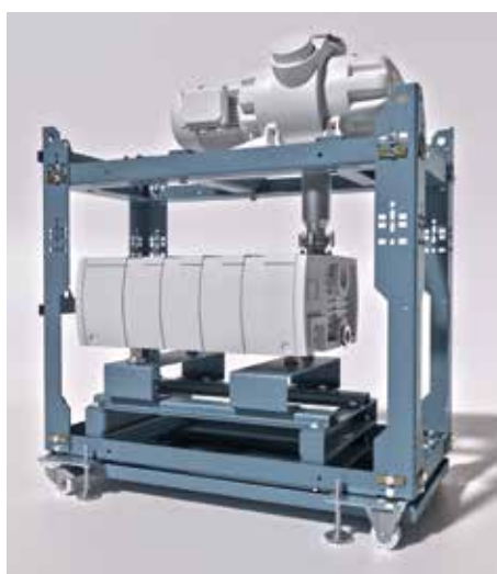
RUVAC WSU 501 / VARODRY VD 100 frame mounted version