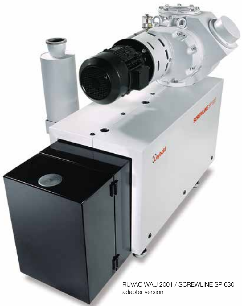
RUVAC WAU 2001 / SCREWLINE SP 630 adapter version