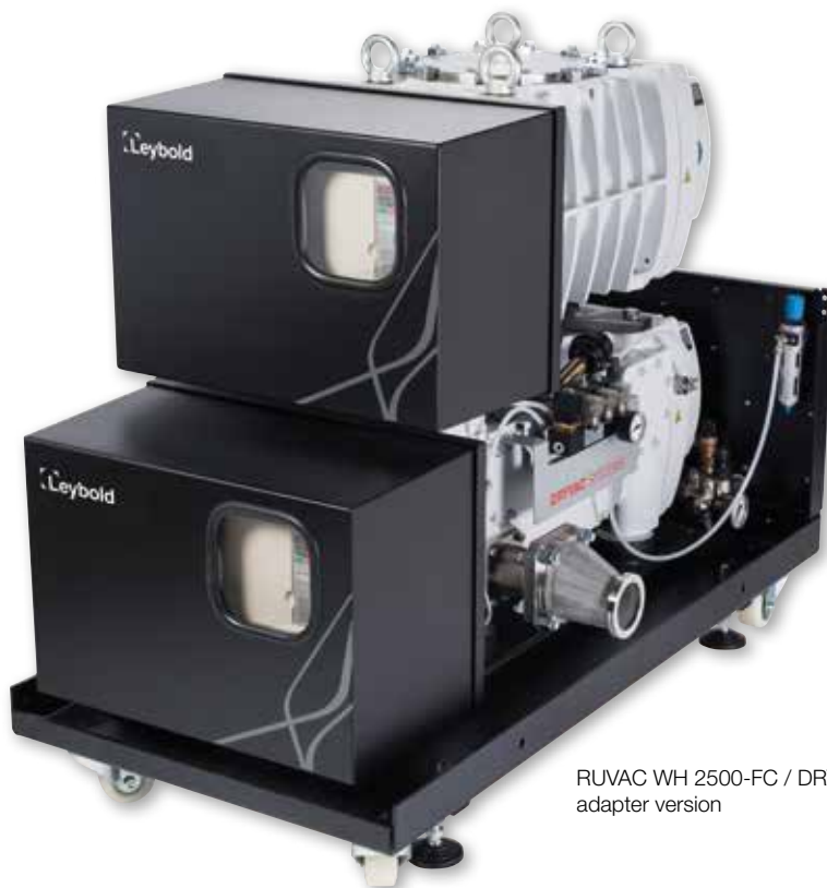
RUVAC WH 2500-FC / DRYVAC DV 650 adapter version

They are also preferred if end users want to minimize their maintenance demands.”