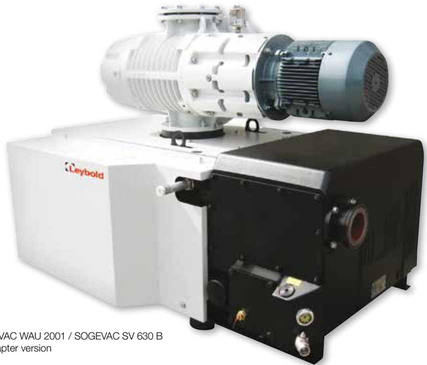
RUVAC WAU 2001 / SOGEVAC SV 630 B adapter version