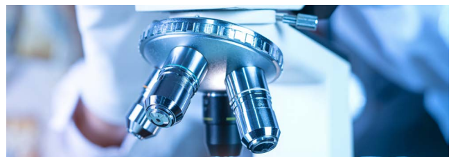
Controller for passive sensors