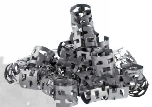
Pall rings made of stainless steel 1.4301

* During the regeneration phase we recommend the use of a second adsorption insert.