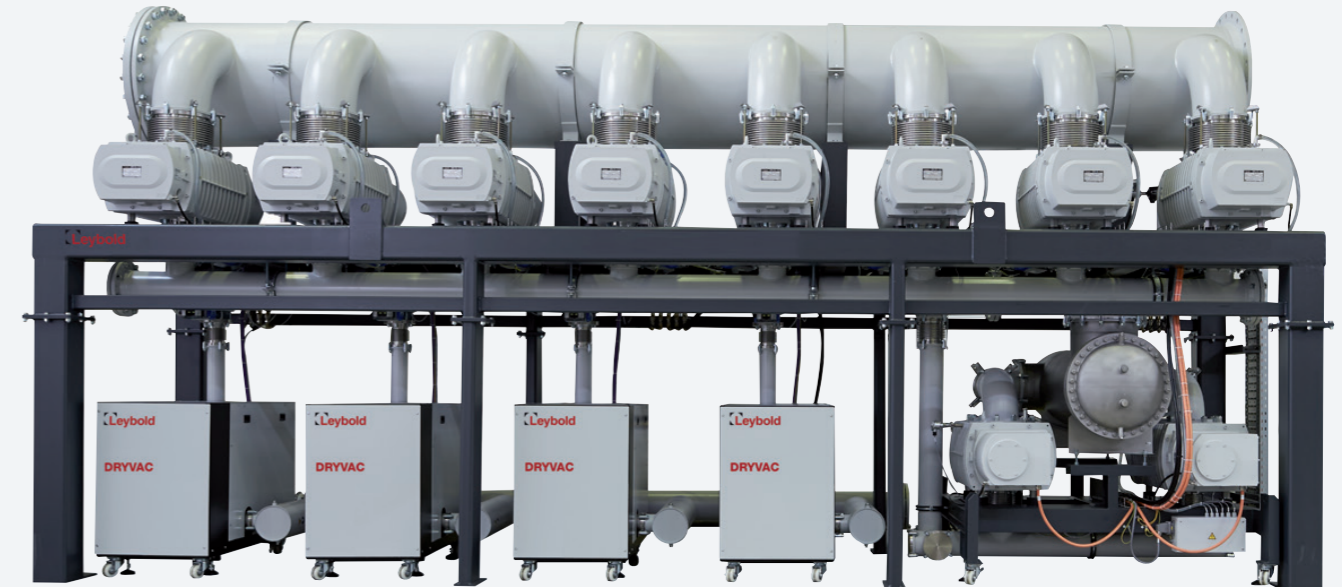
8-2-4 system configuration (ATEX)

DRYVAC dry screw type vacuum pumps are rugged and compact vacuum solutions with integrated smart monitoring and control functions. They are ideally suited for demanding industrial applications. Pumping speed: 450 to 1600 m 3 /h.