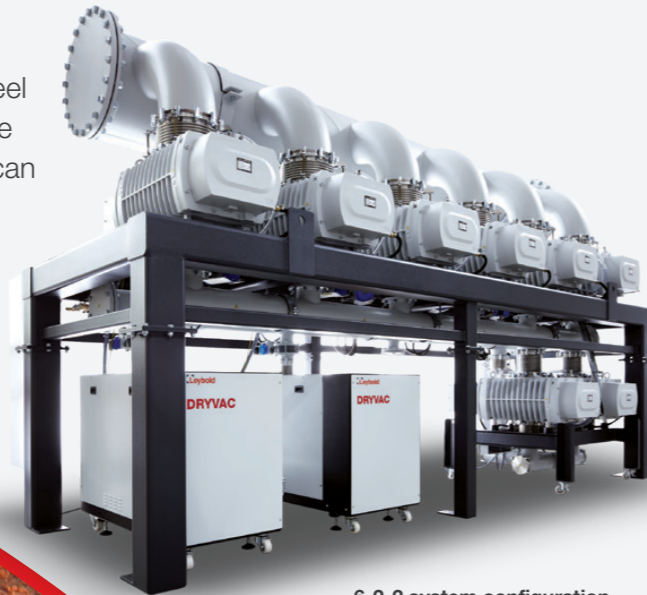
6-2-2 system configuration

State-of-the-art mechanical pumps employ a very reliable design, enabling the pumps to survive inside the rough steel plant environment. By installing standard pumps in multiple arrangements, even highest suction speed requirements can be fulfilled at a competitive pricing.