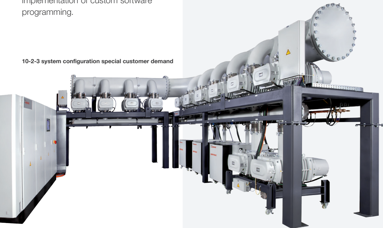
10-2-3 system configuration special customer demand

Our portfolio includes the implementation of custom software programming.