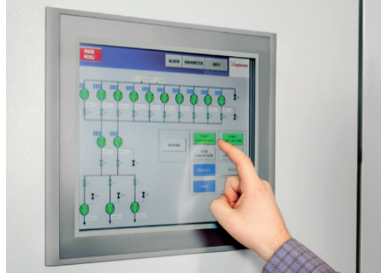
Process-adapted control system