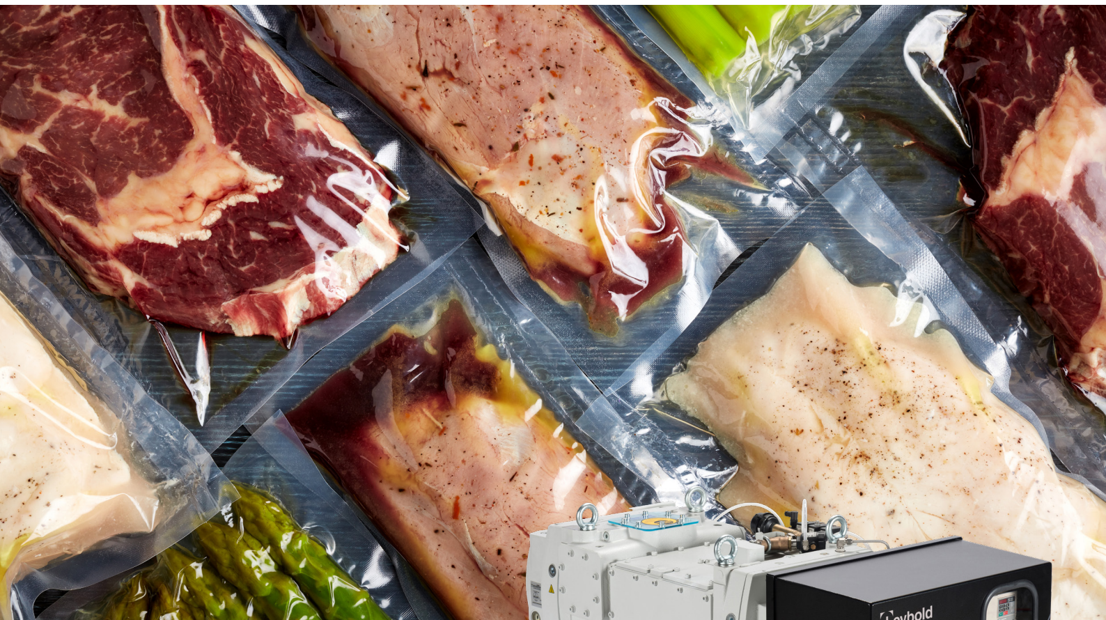
DRYVAC DV 650 dry running fore-vacuum pump for food packaging and processing applications